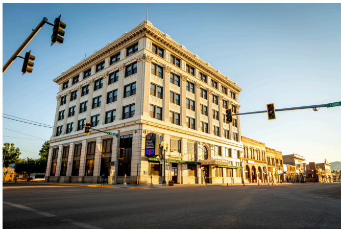
First Bank of Montana, Lewistown Branch

Recipient organizations were selected based on the needs for grant funding to support capacity-building or working capital necessary to strengthen their ability to serve affordable housing or community development needs, including training, predevelopment assistance, management information systems or software, strategic planning, market study or community needs assessment, and working capital.