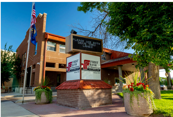
First Bank of Montana, Choteau Branch

“We are thrilled to see grants from our Member Impact Fund having a direct, positive impact on the communities in which our members help advance affordable housing and community development needs in a meaningful way.”